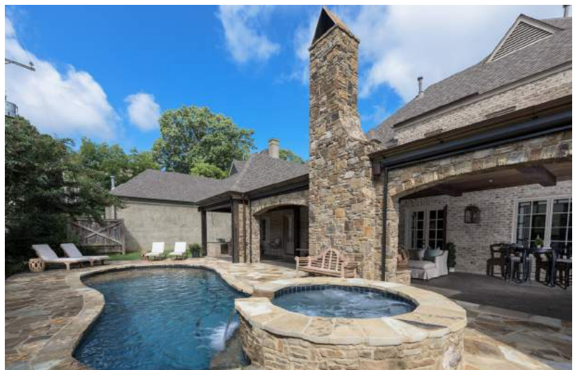
The hot tub comes with a waterfall, a cool effect that adds serenity while relaxing on the patio.

They bought the East Memphis home in May 2013. Their space was tight but Tim Disalvo Co., (who did the entire renovation and was the original builder of the home in 2006) worked out the ideal configuration. The Toys were able to break ground in June 2014 and the project was completed three months later.